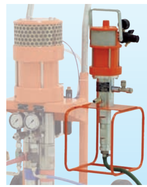
Thanks to a long potlife a reliable application is also possible with single-component pumps.

MC-Injekt 2300 NV can be applied easily and reliably due to its enormously low viscosity. Even the finest cracks are filled right down to their roots. In addition, the elastomer resin offers a long application time. However, should MC-Injekt 2300 NV encounter water within the building element, reaction time accelerates - guaranteed waterproofing success at the right spot and the right time!