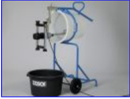
Mixing device tilted